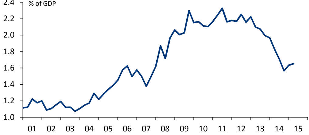
Chart 1: Engineering construction work done by or for the public sector as a pc of GDP 2.4 7 % of GDP